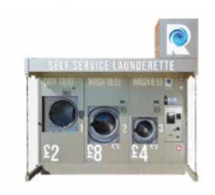
Photo-Me International, continue to shake up the market with their 'Revolution' sechnology for 2020 – outdoor laundrettes with economic, commercial, and environmental benefits. Self-access machines are used in a growing number of areas (installed in various sites around the Uki (including construction, retail, leisure and the public sector in universities as the latest technology for several controls.) for departments to procure.

The Revolution Compact and Compact S as operated by Photo-Me, are ideal for washing large or heavy loads such as duvets, blankets and pillows finishing in a record time of 30 minutes per cycle. The external launderette service open 24/7 is the latest innovation in mass washing